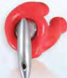
Cell Phone/MP3 Mold