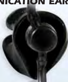
SHS Combo Earmold