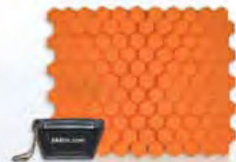
S-PAK™ Foam Plugs