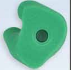
Water Sports Ear Plug