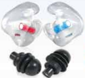
Stock & Custom