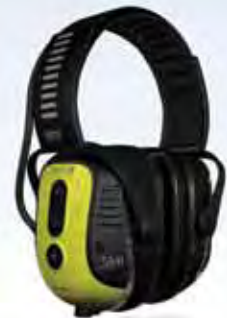
SM1 Ear Muff