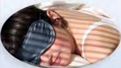
Sleep & Meditation