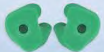
Water Sports Earplugs

Over 1600 Professional Locations Worldwide To Serve You