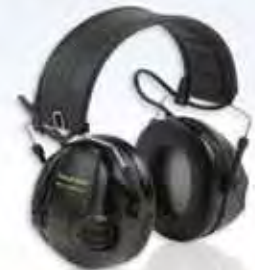
SWAT-TAC™ Ear Muffs