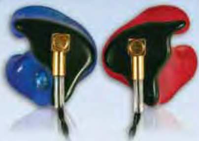
Z2 Professional Music Monitors