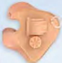
Full Shell for the Advantage, Basic, Plus & Multimemory Models