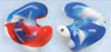
Chameleon Ear™ Earplugs

Water Sports Earplugs. Used by many who want to hear some of their surroundings but keep water and cold air from entering their ears. Great for active individuals who are trying to prevent surfer's ear and other complications from water activities like ear infections, etc.