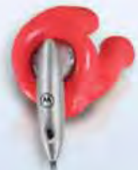
Cell Phone/MP3 Ear Molds