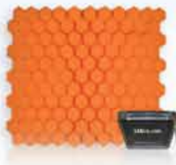
S-PAK™ Foam Earplugs