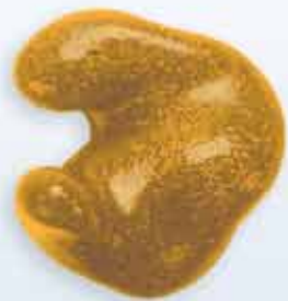
Chameleon Ear™ Glitter