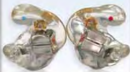
Z3 Professional Music Monitors