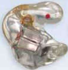
Professional Music Monitors