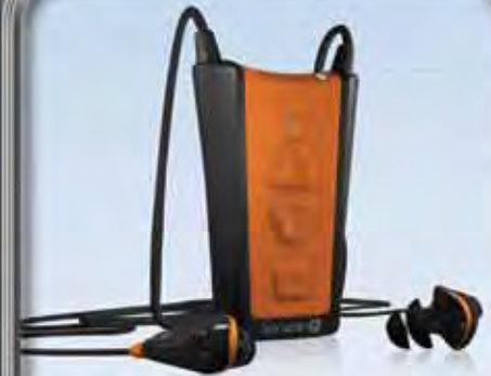
SP1 x Electronic Earplug