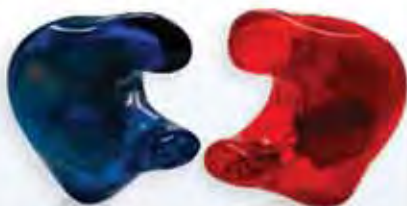
Z5 Professional Music Monitors