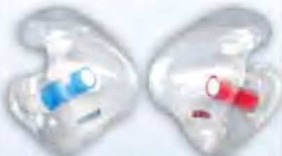
Upgradable to Custom Models