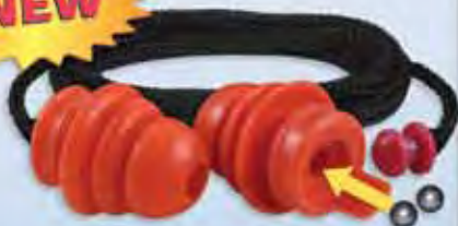
NEW EarPlugz-PC™ with Removable Pop Cords and Metal Inserts

HearDefenders-DF™ multifunctional dual-filtered hearing protectors are designed to help the wearer hear speech and communications better in noise and can be hooked up to radio communications. Unlike most filtered ear protectors, HearDefenders-DF™ are designed with VARIABLE ATTENUATORS . As sound levels increase, so does sound suppression.