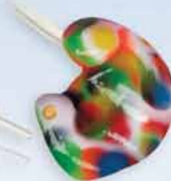
Behind-The- Ear (BTE)