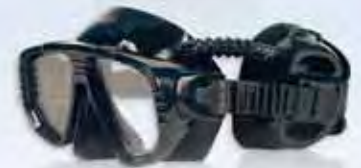
ProEar 2000™ Diving Mask