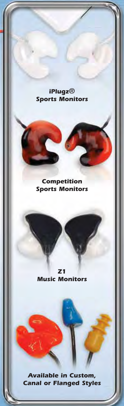
iPlugz® Sports Monitors

These products are produced for the enjoyment of listening to audio and communication devices. Please be aware of the dangers of listening to these devices at a loud volume (85 dB+). OSHA regulations state a volume of 80-85 dB is safe for an eight hour period of time. If you are concerned about your hearing, consult a hearing specialist who can advise you about safety levels with your audio device.