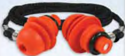
Removable Cord Included