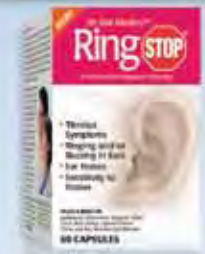
RingStop™ Herbal Remedy

The E.A.R. Sound Checker™ is a personal Sound Level Meter which indicates if sound levels are safe or dangerous to help determine whether hearing protection should be worn. Just point the E.A.R. Sound Checker™ toward a sound source, press the button and three LED Lights indicate decibel levels in the surrounding area.