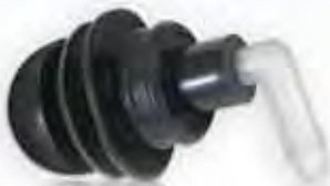
Optional L-Joint Connector