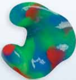
Chameleon Ear™ Swirl