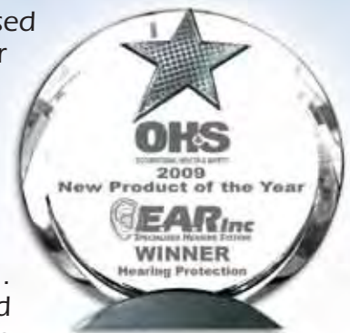
Winner, Occupational Health & Safety's New Product of the Year!

Many standard hearing protectors go unused because they minimize the ability to hear critical sounds needed for communications and environmental awareness, and often do not fit properly. That is why E.A.R., Inc. now provides this advanced technology. Breathable, moisture-resistant dual filters improve sound quality when the ear is overloaded with noise (continuous or impact). Musicians and music lovers who attend loud concerts or those who work where loud music is played especially appreciate HearDefenders-DF's acoustical response.