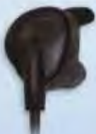
Whisp-Ear™ EarMic Systems