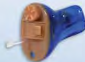
Wireless Private Ear™

Over 1600 Professional Locations Worldwide To Serve You