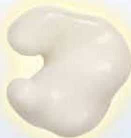
Chameleon Ear™ Glow

Other colors and color combinations are also available