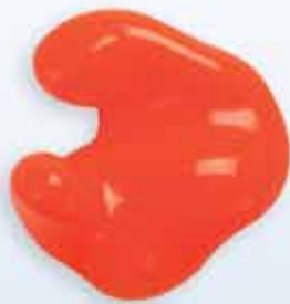
Chameleon Ear™ Solid Color