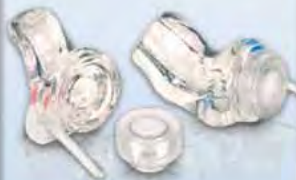
Musician's Filtered Plugs

In-Ear-Monitoring Systems have become the product of choice for performing artists and recording studios and for those who want to extend their abilities