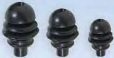
Available in Large, Medium and Small