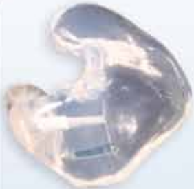
Chameleon Ear™ w/Acoustic Filter